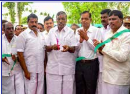
Inauguration by Thiru K P Anabalan , Ex Higher Education Minister TN.